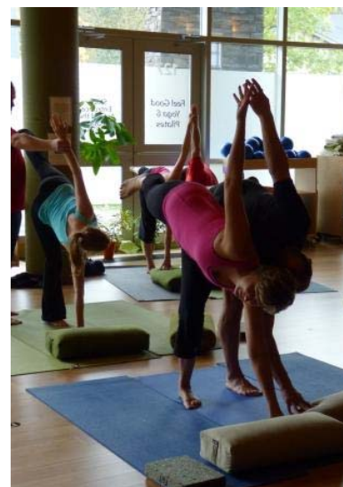
Yoga for two workshop coming up!