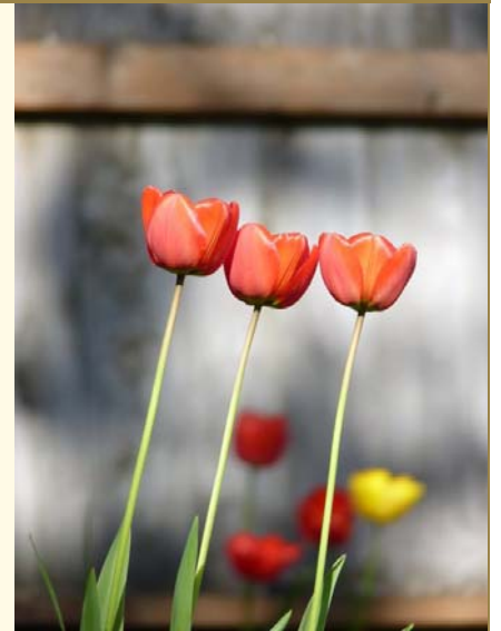
Summer is here!